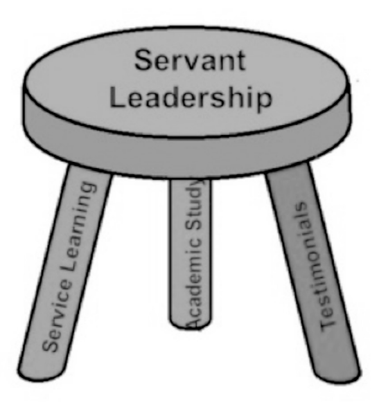
Figure 2: Servant Leadership Stool

as they relate experiences and offer counsel on leadership actions proven to be both successful and unsuccessful. The third portion of the servant leader experience is "Service Learning." Students are asked to volunteer 15 hours helping at agencies in the metropolitan region. Most often, the required tasks and environments in which the volunteer activities are completed prove to be quite challenging for the students.