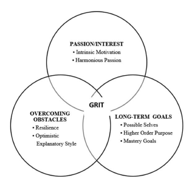
Figure 2: Resilience as a Component of Grit (Almeida, 2016)